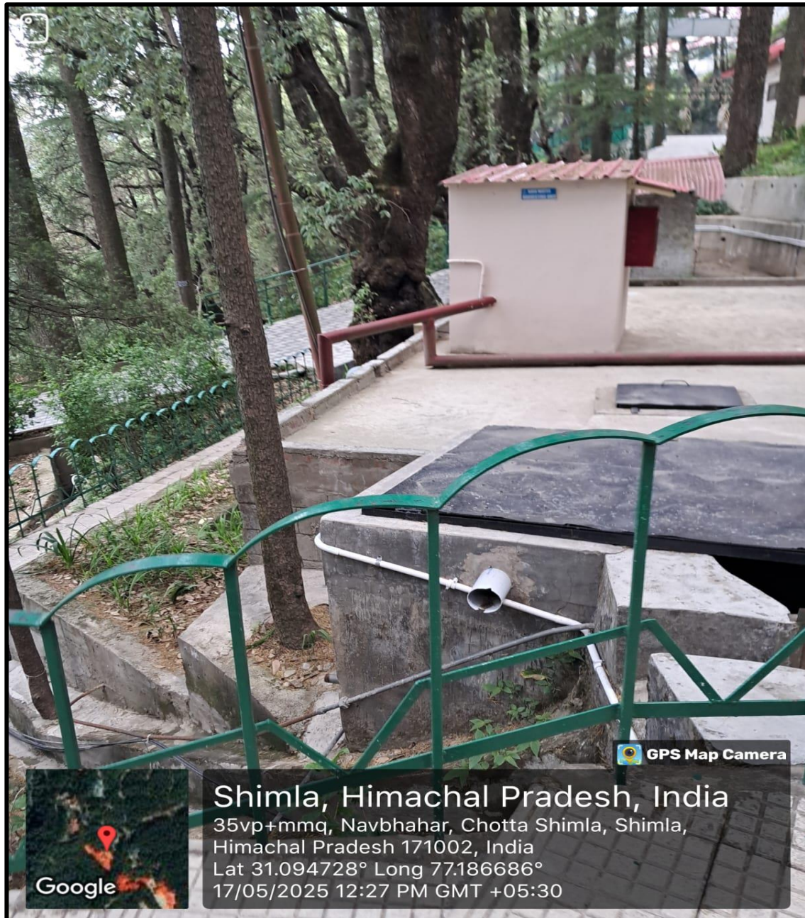
Rainwater Harvesting System