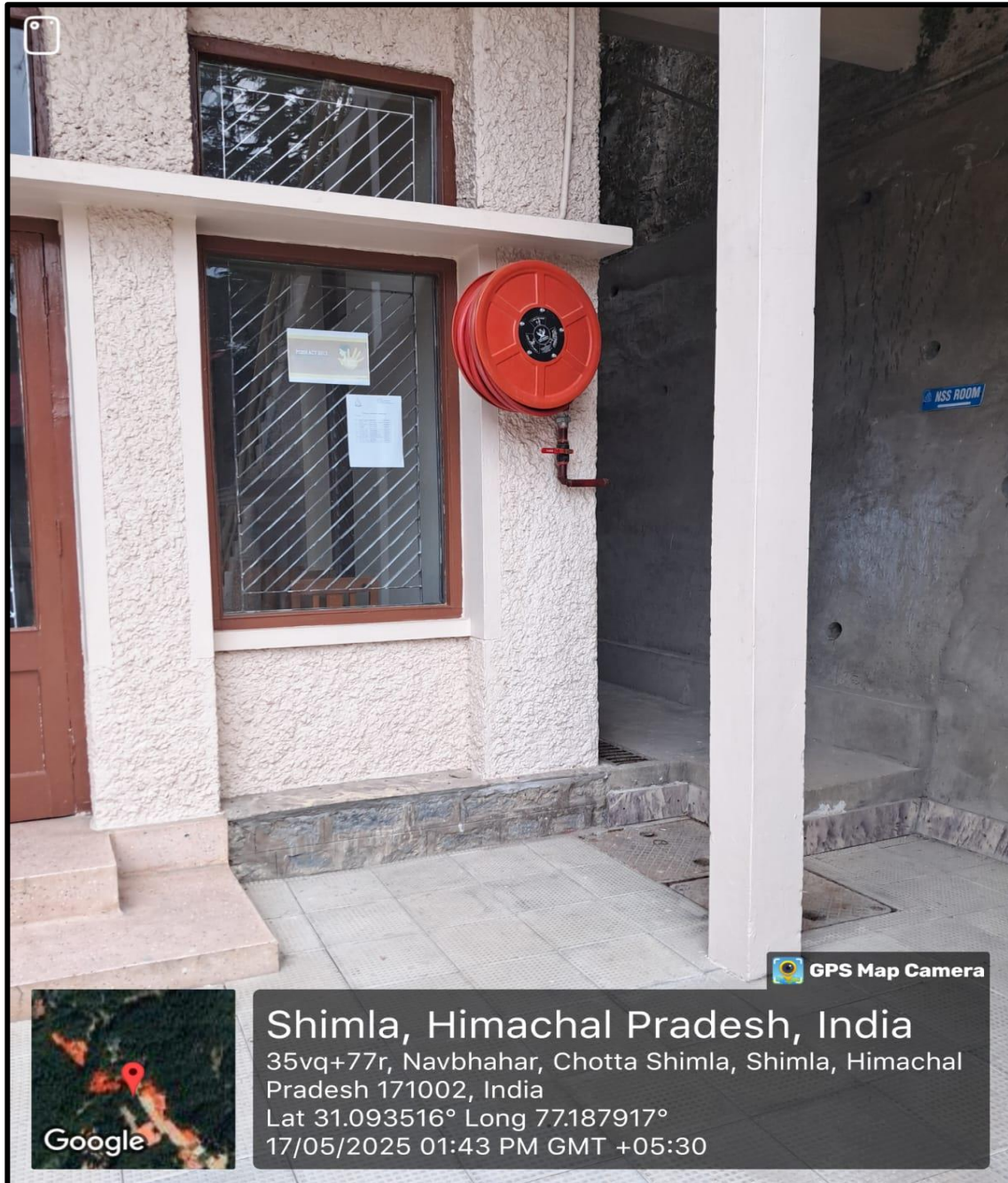
Fire Hose System