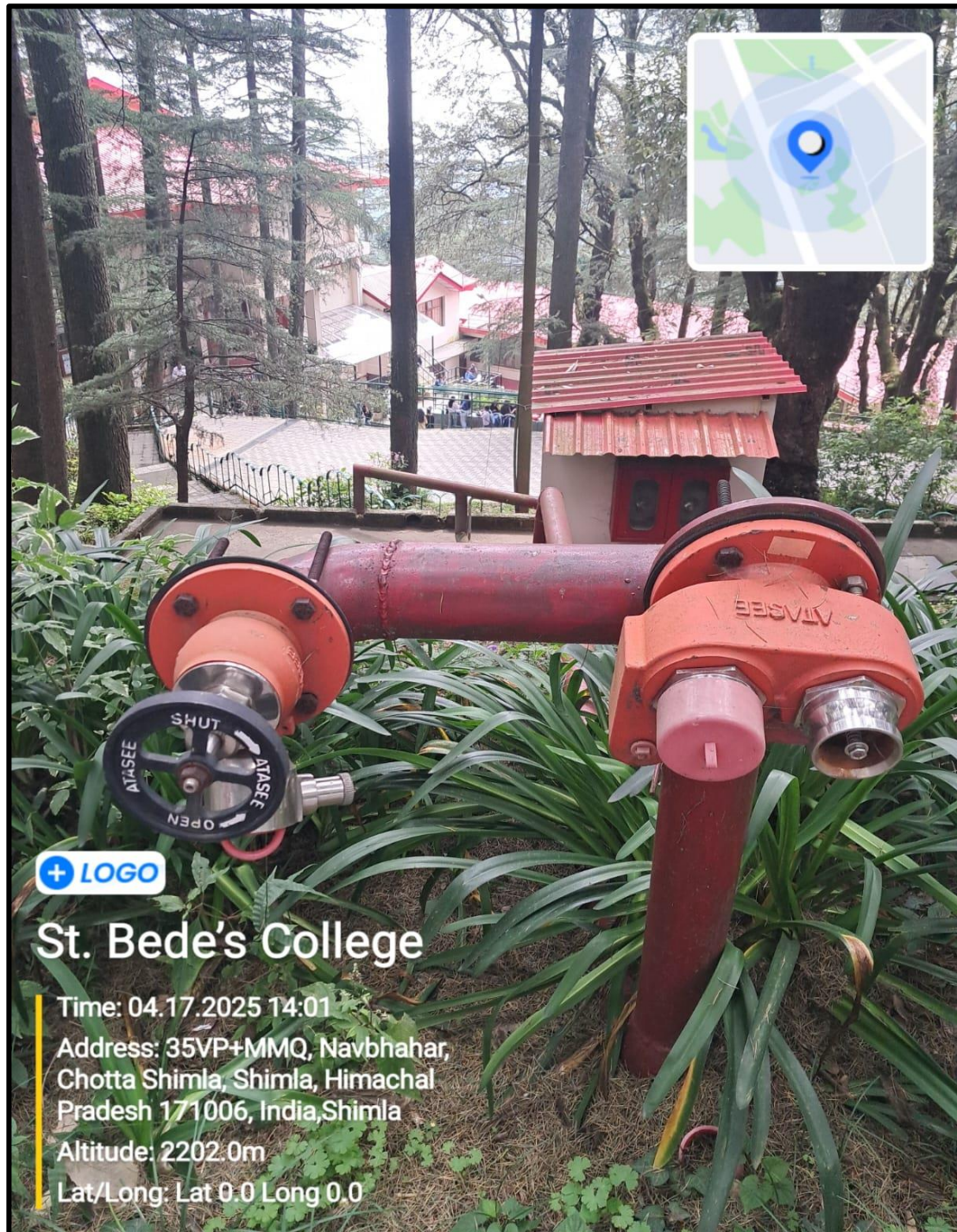
Rainwater Harvesting Tank acts as Pumping Station